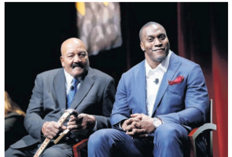
Former NFL players Jim Brown, left, and Takeo Spikes are shown during a sports and activism panel entitled "From Protest to Progress: Next Steps" Tuesday, Jan. 24, 2017, in San Jose, Calif.

The league this year also introduced the Inspire Change Changemaker Award, given to 32 individuals, one from each team, who are making a difference in their communities through social justice work, either individually or as part of a nonprofit organization. Each Changemaker will be